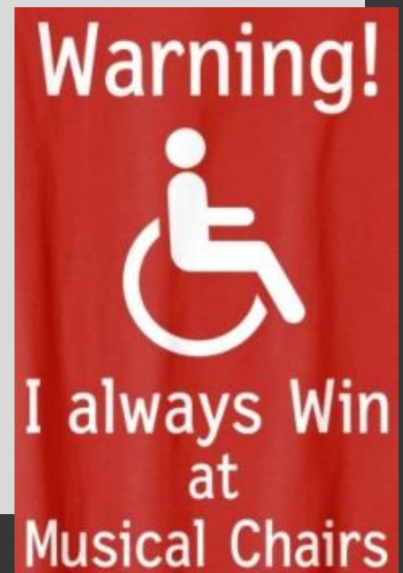
image 3 description: Shows a person on a wheelchair and reads Warning. I always win at musical chairs

image 2 description: Reads Cinnamon Rolls NOT gender Rolls