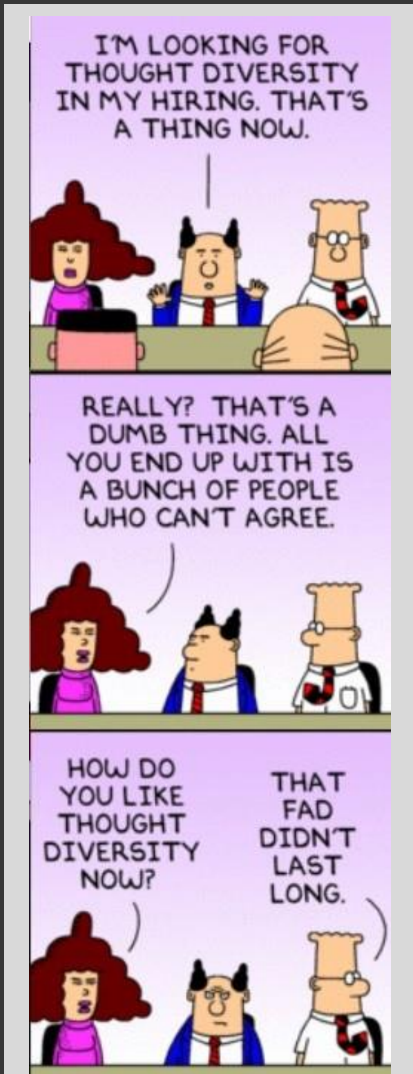
Image 1 Description of a Cartoon with 3 clips Clip 1: Boss says "i am looking for thought diversity in hiring. Thats a thingnow." Clip 2: His colleague says "Really? That's a dumb thing, all you end up with is a bunch of people who cant agree." Clip 3: After some days, the colleague asks " how do you like it now ? And and 2 second colleague answers " That fad does notlast long.