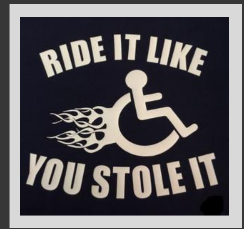
Pic 2 image description: Showing a person on a wheelchair with fire coming out of the back of the wheelchair. Says ride it like you stole it

Pic 3 image description: Showing a range of people from man to woman Reads Whatever, Just wash your hands