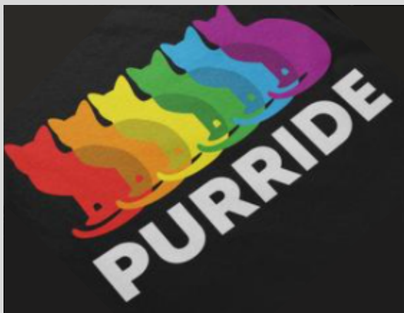
Image 2 description: Showing cat figures in many colors - text reads PURRIDE