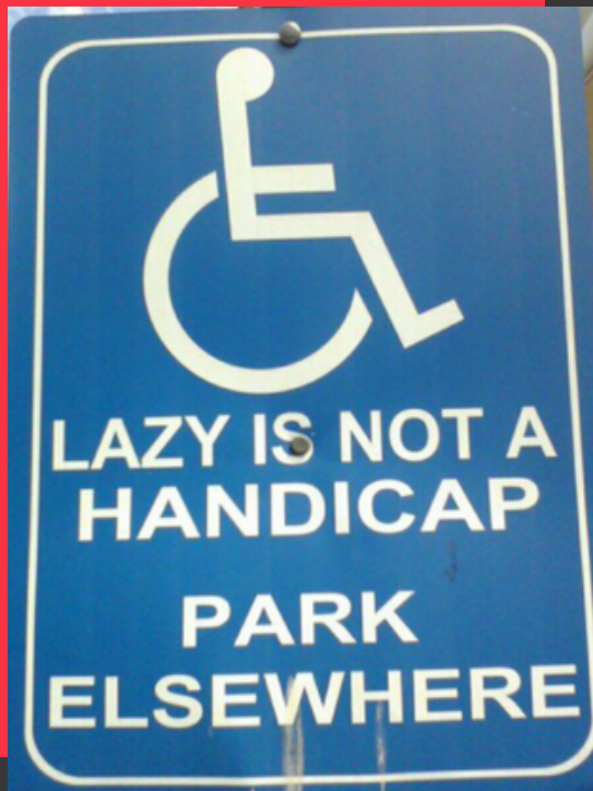
Image 2 description: An image of a person on a wheelchair. Text reads: Lazy is not a handicap. Park elsewhere.