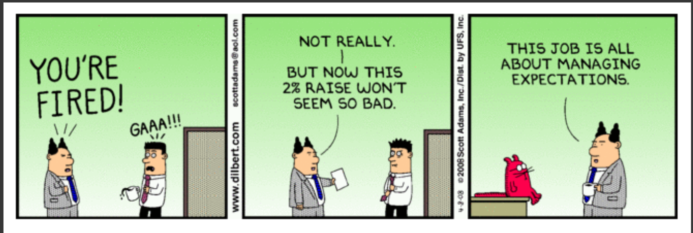
Image 1 : Boss says " You are fired" to an employee. Employee is sad.

Image 2: Now the Boss says " Not really.. But now the 2% raise wont seem so bad"