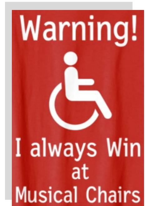
image 3 description: Shows a person on a wheelchair and reads Warning. I always win at musical chairs

image 2 description: Text reads Cinnamon Rolls NOT gender Rolls