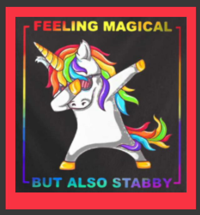
Image description: An image of a person on unicorn. Text reads: Feeling Magical But also Stabby.